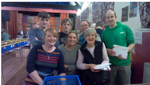
Leaders and Executive Committee members sorting the post at the District Sort Christmas 2014