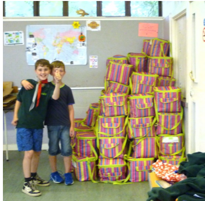
Those bags and towels!