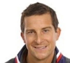
Bear Grylls—Chief Scout

'Two things matter in life: following your dreams and looking after your friends. That's what I love about Scouts.'