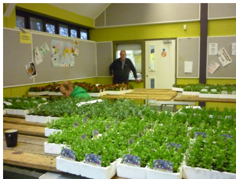
Bedding plants already for collection or delivery.